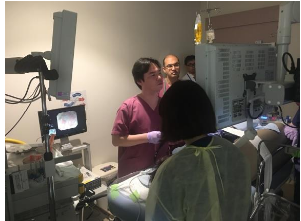
Surgery observation at Juntendo University Hospital