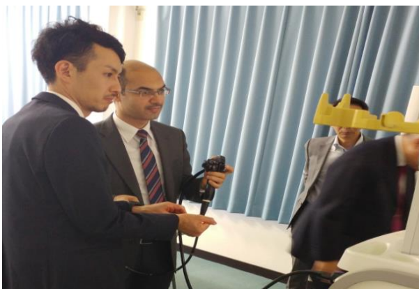
HOYA Corporation PENTAX Lifecare Division