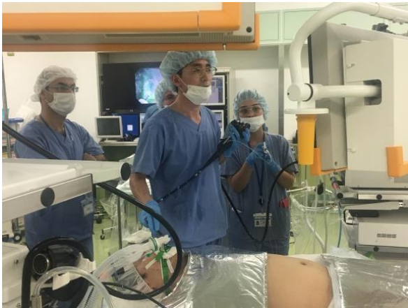
Surgery observation at Showa University Koto Toyosu Hospital