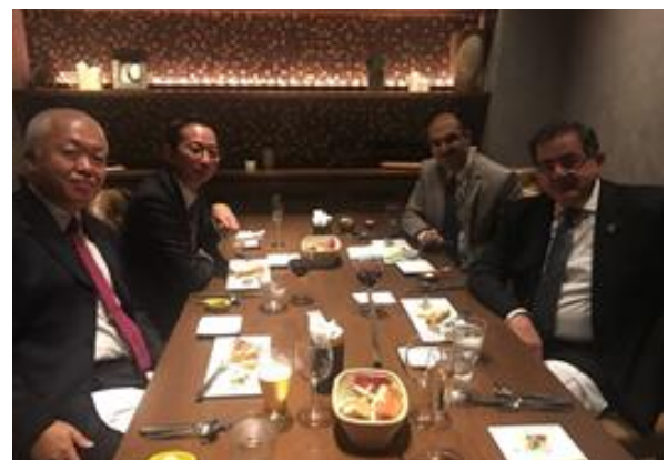
Dinner hosted by Embassy of the Republic of Iraq in Japan